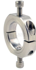
*Additional hardware NOT included