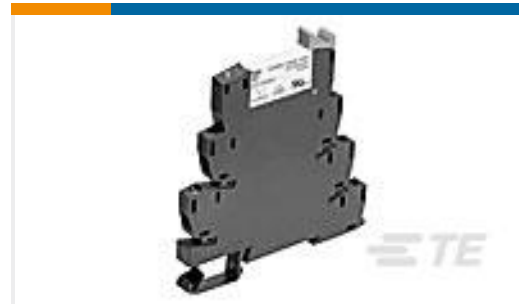
TE Part #3-1416100-2 ST3P3LC4