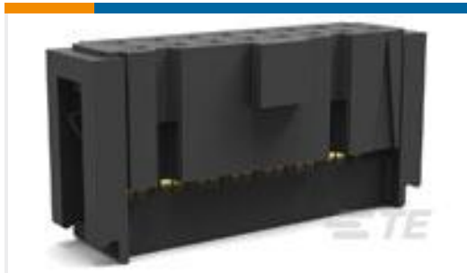
TE Part #1-1658527-3 622-4041LF FEM SOCKET, LEAD FREE