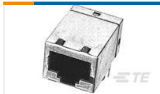
TE Part #100616-1 8/8 MOD.JACK ASSY TE SHIELDED