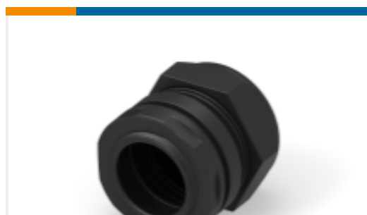
TE Part #1478769-5 ANTI-VIB NYLON GLD 25MM BLK