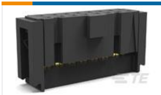
TE Part #1658527-4 622-1041LF FEM SOCKET, LEAD FREE