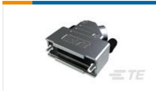
TE Part #1-2198618-5 Ni Pltd Plstc Backshell, 15 Way, 45 Deg