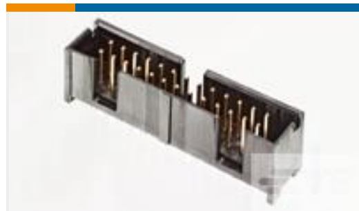
TE Part #2-1761603-7 IDC LOW PRO HDR 20P VERT BLUE