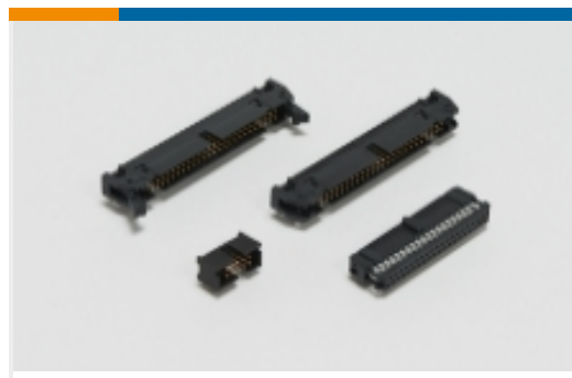
Ribbon Cable Connectors(525)