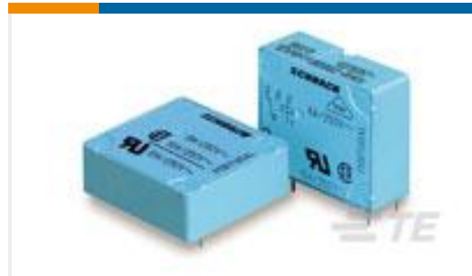
TE Part #6-1393215-9 V23057-B0002-A201