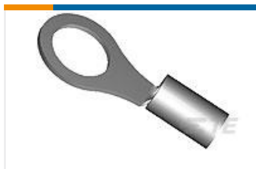
TE Part #321869 TERMINAL,SOLIS R 2/0 1/4