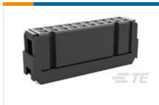
TE Part #1658620-4 20 NOVO MIL 15DP, LEAD FREE