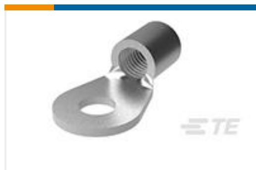
TE Part #31807 TERMINAL,SOLIS R 8 10