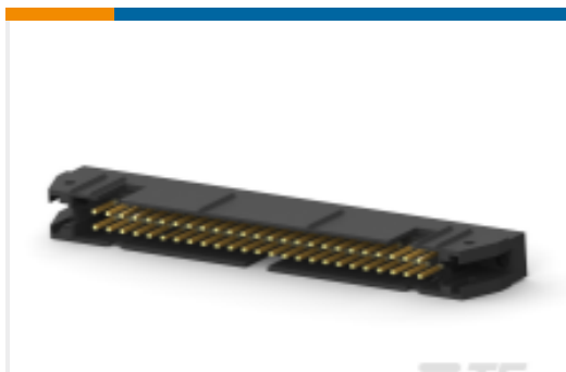
TE Part #5102154-5 AMP-LATCH UNIVERSAL HEADERS