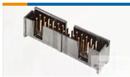
TE Part #2-1761603-5 IDC LOW PRO HDR 14P VERT BLUE