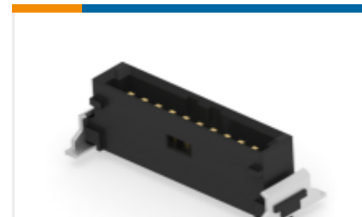
TE Part #294919-E SRCP 1,27 10 M 1 SMD 137 E1 094 * GU-H *