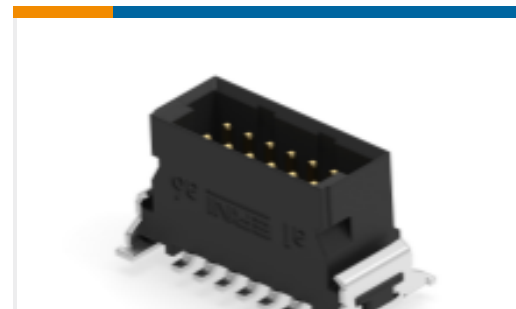
TE Part #244836-E SMCQ 12 M AB VW 8-13 CL * H007 137 E005