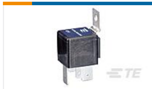
TE Part #3-1414937-3 V23134J0065X497-EV-CBOX