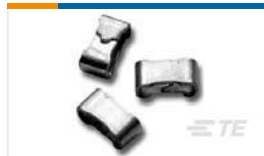
TE Part #1625854-1 1206 PROBE PAD