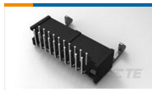
TE Part #2-1761607-3 IDC LOW PRO HDR 10P RA LG LAT