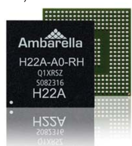
The 14 nm H22A SoC Device

H22A also supports multi-sensor input, thus enabling recording systems that require two or more independent sensor inputs. The quad core Arm®-A53 cores allow implementation of ADAS features such as forward collision warning, lane departure warning, driver monitoring, license plate detection and recognition, etc. The software development kit is available in RTOS (ThreadX) / Linux / RTOS + Linux (dual OS) for customers to implement their applications.