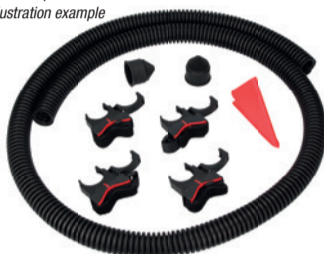
Abb. beispielhaft Illustration example