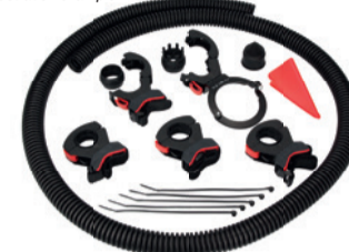
Abb. beispielhaft Illustration example