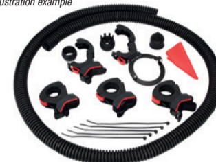
Abb. beispielhaft Illustration example