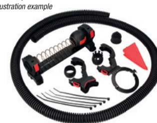
Abb. beispielhaft Illustration example