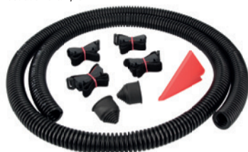
Abb. beispielhaft Illustration example