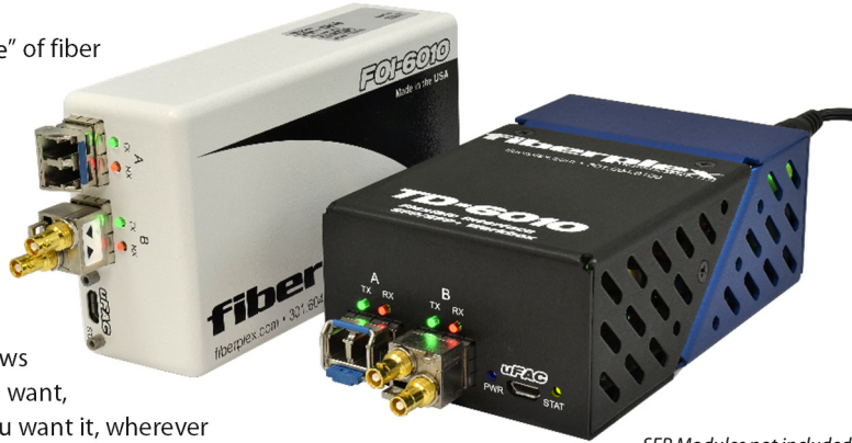
SFP Modules not included

The true “Swiss Army Knife” of fiber optic transport, the FOI(TD)-6010 in conjunction with any combination of a myriad of FiberPlex or third party SFP/SFP+ (Small Form-Factor Pluggable) optical & electrical transceiver modules, allows you to transport what you want, when you want it, how you want it, wherever you want it; all over one product solution... The FiberPlex FOI-6010 or TD-6010 and SFP/ SFP+ module should be in everyone’s toolbox.