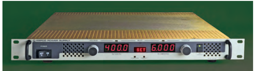
KLR MODEL TABLE