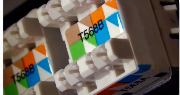
360 Viewer (View Objects at a 35 Degree Angle)