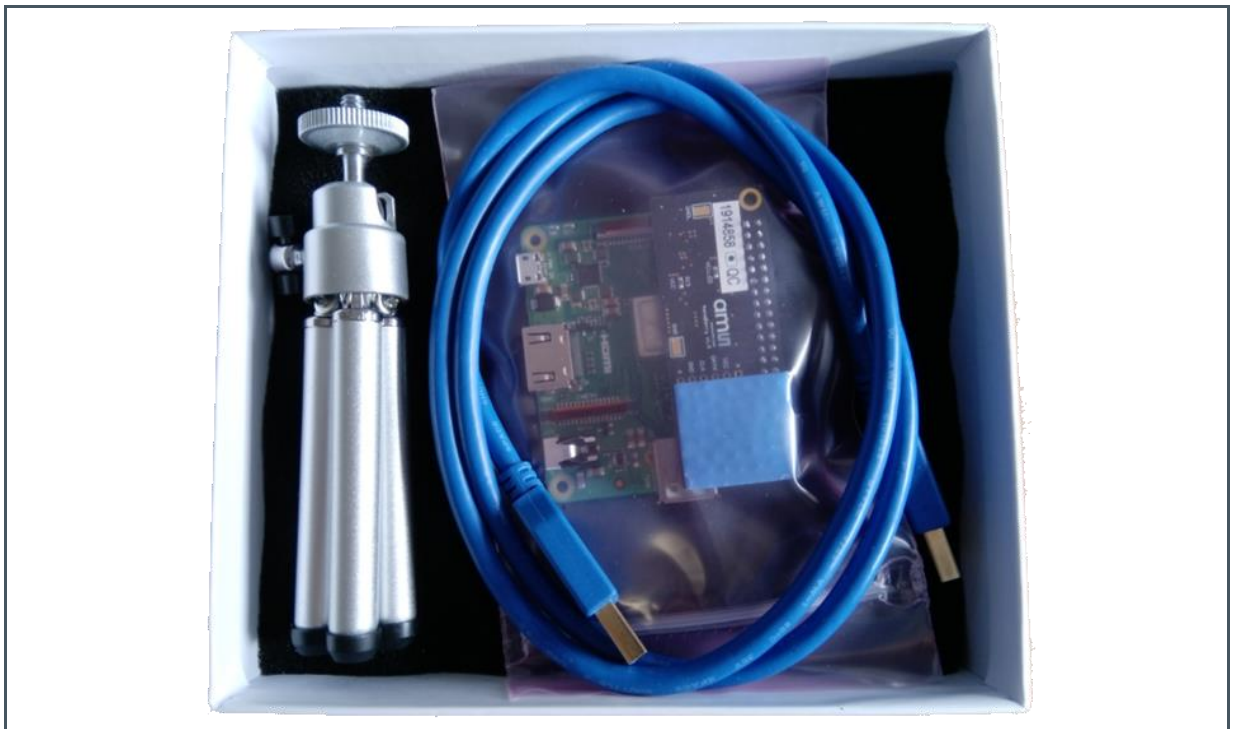
Figure 1: Eval Kit Content