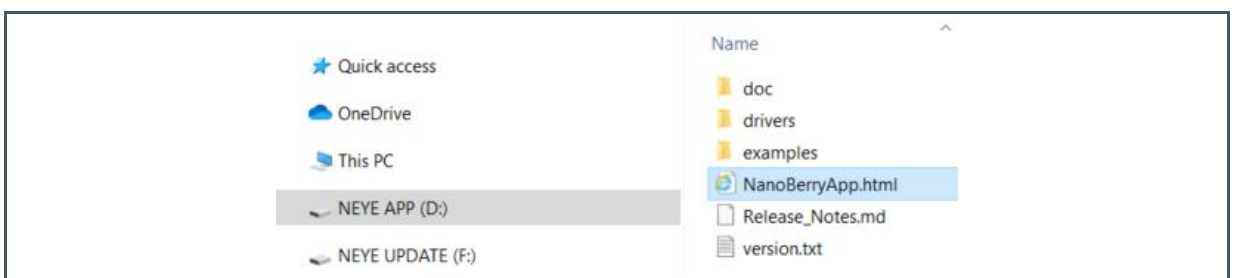
Figure 3: Drives Mounted on PC

Further help and instructions are in the Release_Notes file.md. (it can be opened in any text editor).