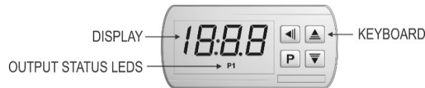
Fig. 2 – Frontal Panel

The N321 energizes the output relay such as to maintain the process temperature on the setpoint value defined by the user. The output status led P1 signals when the control output is on.