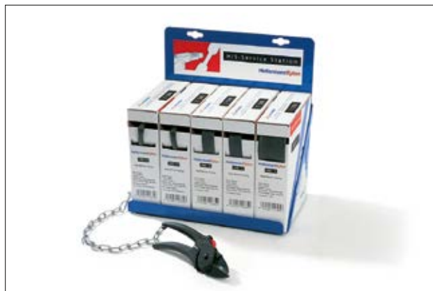
HIS-Service Station contains 5 dispensers and a special cutter.