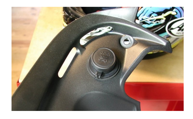
STEP #6 – Replace the panel and the seat. Enjoy!

STEP #5 – Apply the remaining ty-wrap to the wiring harness and the existing wiring harness. Do NOT allow the harness to directly contact the motor or exhaust.