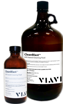
FCLP-SOL1 7.61 oz / 225ml

FCL-P1005 FCL-P1000 FCL-P2000 FCL-P1005-EU FCL-P1000-EU