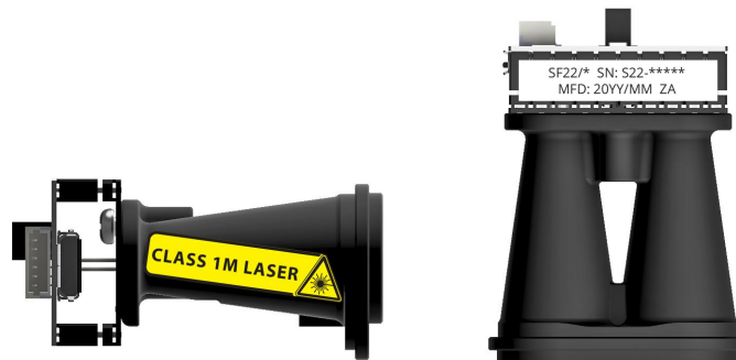
Laser radiation information and product identification labels