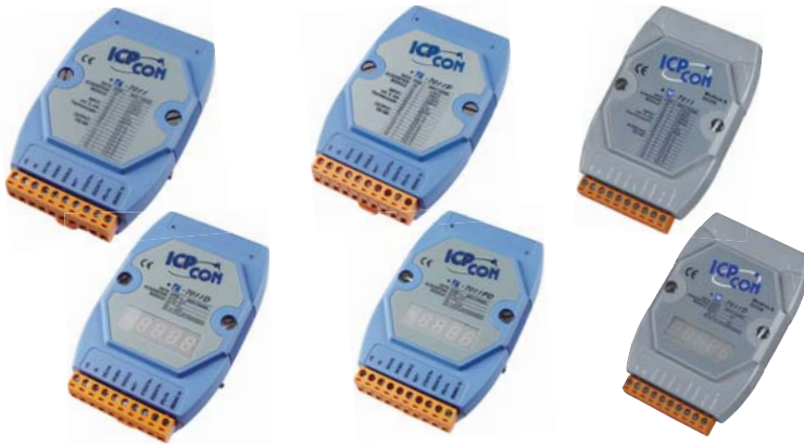
I-7011(D) I-7011P(D) M-7011(D) 1-channel Thermocouple Input Module