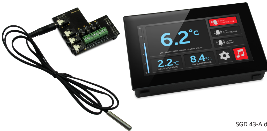
SGD 43-A display sold separately

S43-TP is a four-channel thermistor board to add temperature measurement functionality to the SGD 43-A PanelPilotACE display. Within the PanelPilotACE Design Studio software users can choose to display, log or graph the temperature inputs.