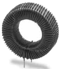
VERTICAL SELF LEADED MOUNT

Note: All dimensions are in millimeters.