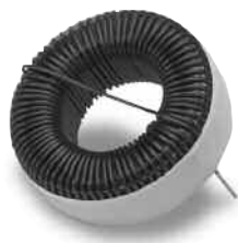
HORIZONTAL SELF LEADED MOUNT