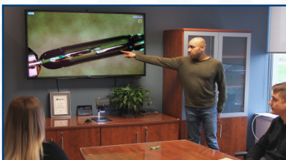
Aven's Dual Gooseneck LED Task Light